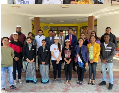
Interaction with locals at Brahma Sarovar lake, visit to Jyotisar, Dharohar, Museum & IHM Kurukshetra