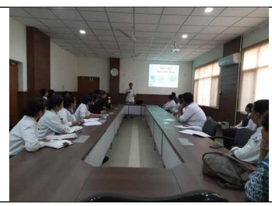
Presentaions on Telangana & Haryana as a part of the exchange program for both paired state students