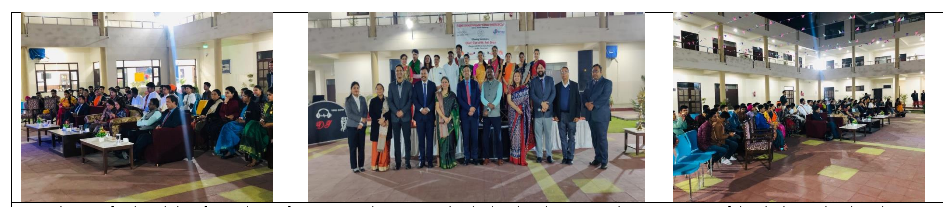
Telangana food workshop for students of IHM Panipat by IHM – Hyderabad, Cultural program Closing ceremony of the Ek Bharat Shreshta Bharat