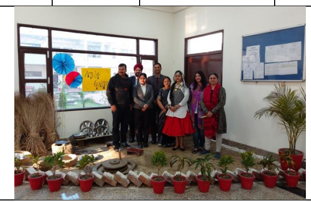
Welcoming at IHM Panipat and student interaction, display of traditional Haryanavi costume and village lifestyle